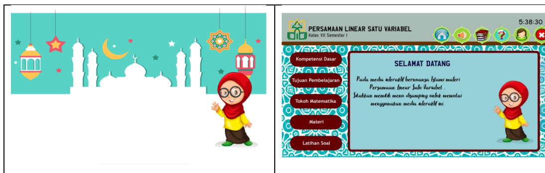
Figure 1. Homepage of media

Islamic nuances referred to in this study are Islamic nuances in terms of material, motivation, background design, character or animation, and back sound as shown in Figure 1 below.