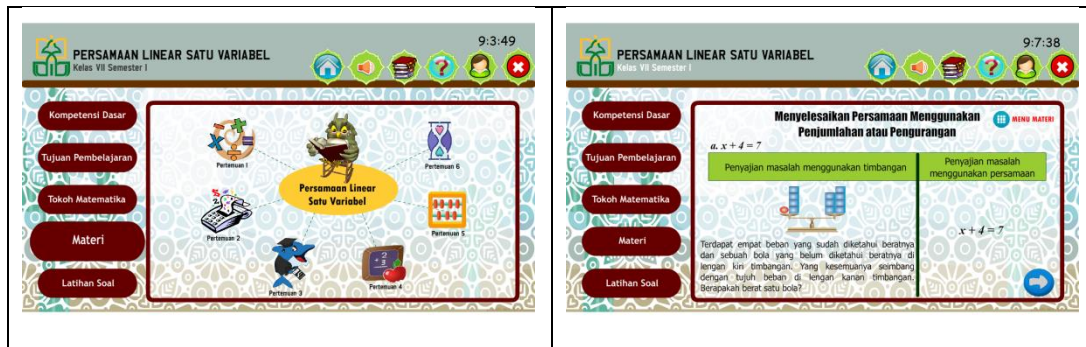
Figure 2. Materials display of media

In addition, for displaying Islamic nuances in terms of the instruments sounds and material for six meetings, this media is also equipped with exercises that can be used by students practicing independently and then students can also find out the final grade obtained because this media has been equipped with score calculations as shown in Figure 3 below.