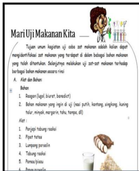
Figure 3. Feature design on the learning media as lab work