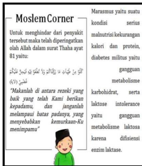
Figure 2. Islamic Values 2 integrated with natural science to Al Qur'an