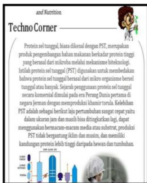
Figure 4. Feature design on the learning media 2 as the development of science in real life