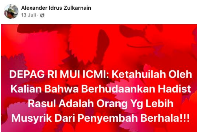
Figure 1 a quote posted by a member of Nazwar Syamsu facebook's group

hadith 16 and a Qur'anist. However, in the many uploaded contents on Facebook, as well as the comments, it is clear that they do not consider hadith as an authoritative source of Islamic norms, as an example of the following quote: