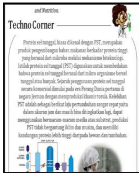
Figure 4. Feature design on the learning media 2 as the development of science in real life