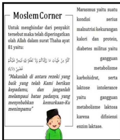
Figure 2. Islamic Values 2 integrated with natural science to Al Qur'an