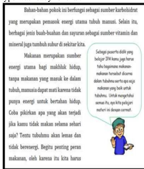
Figure 1. Islamic Values 1 Integrated with natural science

The result of this phase was natural science learning material integrated with Islamic values on the topic of human digestive system for grade VIII Junior High School (MTs), student activity observation sheet, response questionnaire, and Learning Outcome Tests (THB). The learning media resulted from this phase was called prototype 1. In addition, it is also designed the necessary instruments for another activity, i.e validation sheet. Prototype 1 and research instruments was discussed with research team for improvement until a prototype was ready for trial.