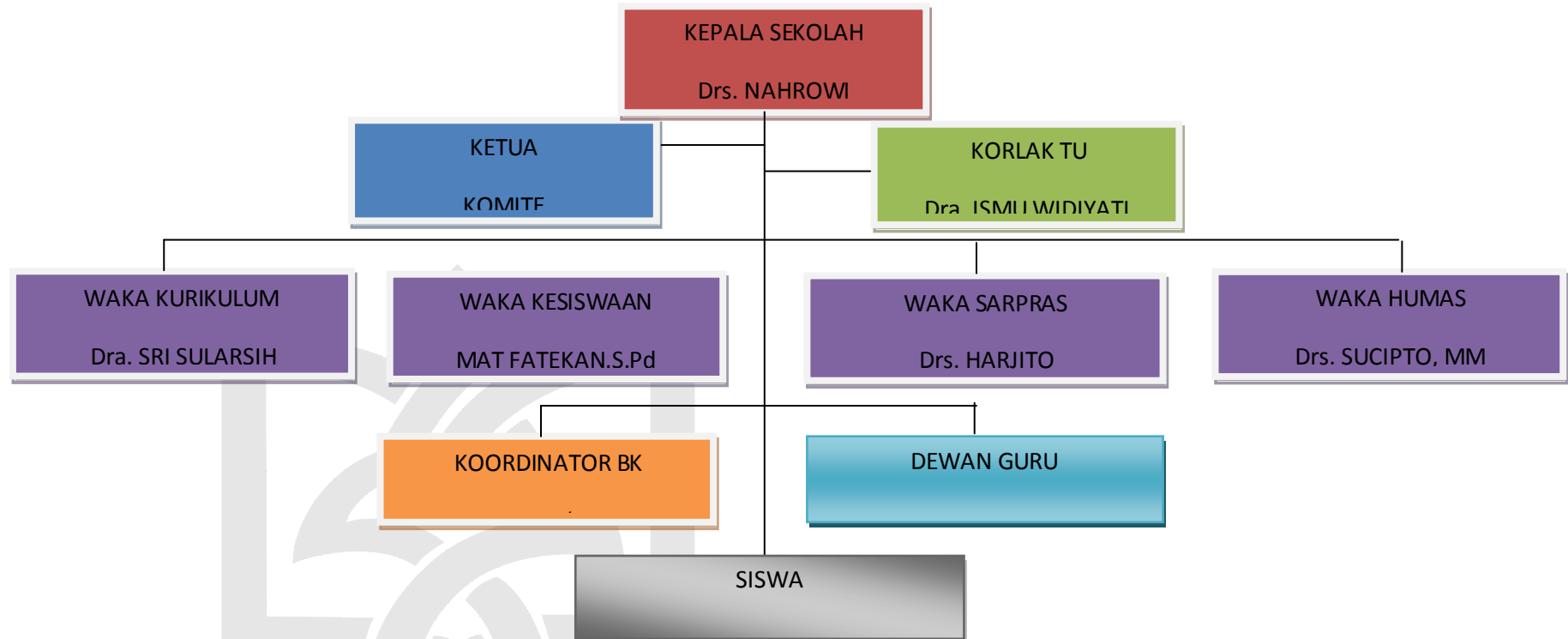
Bagan 3.1 Struktur Organisasi SMAN Rambipuji